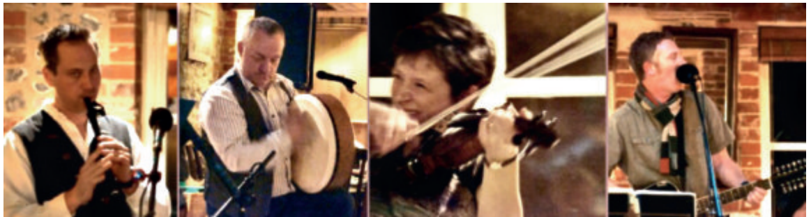
Celtic and Acoustic Music, Guitar, Fiddle, Whistle and Bodhran, Bass

Revel Weird and Wild are a Celtic and folky four person band playing songs and tunes from the Pogues, Waterboys, as well as acoustic rock, traditional Irish tunes and their own compositions. Based in the Portsmouth and Solent area, RWW are known as a footstomping party band who get the audience dancing and singing.