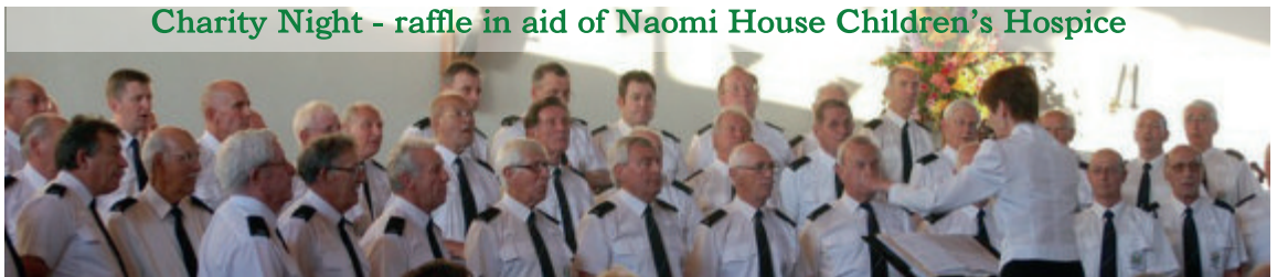
Charity Night - raffle in aid of Naomi House Children's Hospice